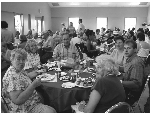
A day of family fun!