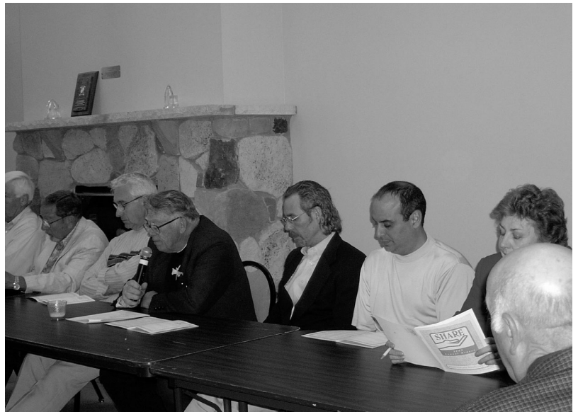
The Board held a meeting at the annual dinner.