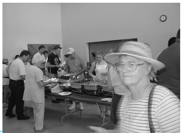
The food is plentiful and delicious!