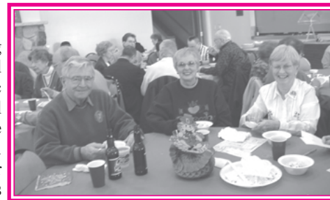
Good food, company and conversation is plentiful at the St. Patrick's Day Party at Sharing Meadows

Following dinner we will have Irish music and our annual Best Irish Joke Contest . Practice your best Irish jokes now and perhaps you will be lucky enough to win the prize along with bragging rights for the year! It's Irish food, fun and entertainment at its best!