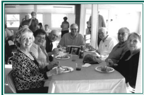
Snowbirds from Indiana joined in the fun