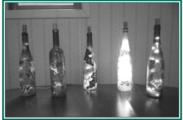
Works of art created by our own villagers and stewards

Vocational training was held mostly indoors for the winter with the St. Tim Camp Building the center of activity. A pot of soup was made each week, filling the building with wonderful aromas and providing the entire community with a warm winter supper. Rugs were woven, black walnuts were cracked, and ceramics were painted and fired as they kept busy during the long winter days. A couple of new projects were started and the results are absolutely amazing!