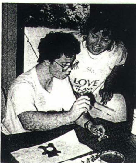
Indoor arts and crafts

Would I? She scurried to color one, the best she could do, just for me. Did I treasure it? Just guess. Apple Acres is a place apart - where everything and everyone gets brushed by the gift of love.