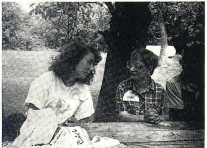
Making rainbows and other art outdoors

Her most challenging task at Apple Acres has been "getting enough sleep," she said. The most rewarding part is the fellowship and friendship of the campers and counselors. "There is so much love out here," she said, "It's just amazing." (There's that word again.)