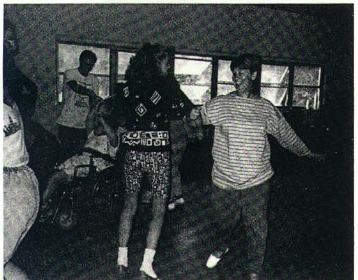
Instructors help out with . . . dancing